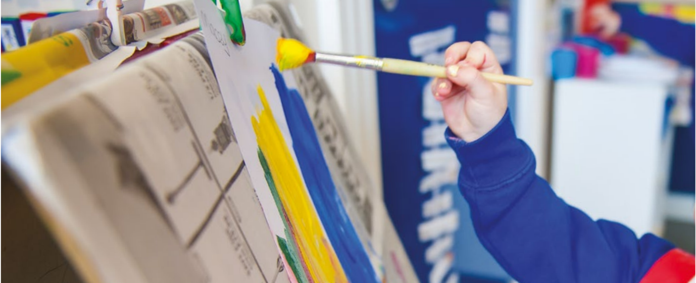
"PLAY IS OFTEN TALKED ABOUT AS IF IT WERE A RELIEF FROM SERIOUS LEARNING. BUT FOR CHILDREN, PLAY IS SERIOUS LEARNING. PLAY IS REALLY THE WORK OF CHILDHOOD." FRED ROGERS